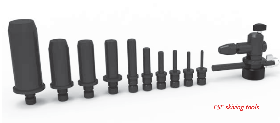
ESE skiving tools

ESP is available in: \frac{3}{16}" , \frac{1}{4}" , \frac{5}{16}" , \frac{3}{8}" , \frac{1}{2}" , \frac{5}{8}" , \frac{3}{4}" , 1" , 1\frac{1}{4}" , 1\frac{1}{2}" , 2" , 2\frac{1}{2}" , 3"